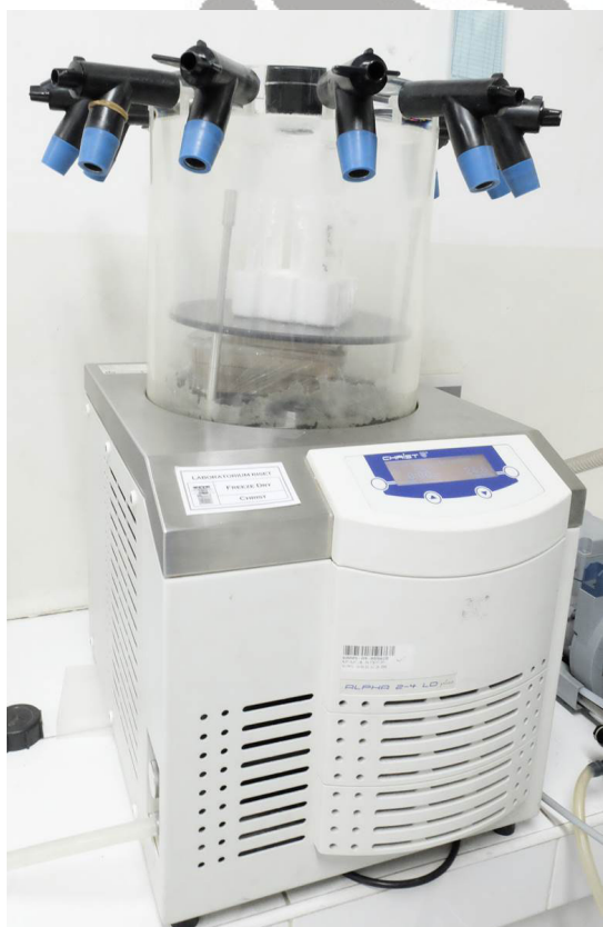
Figure 2. Freeze dry machine, Christ, Alpha 2-4 plus

The cell then dropped on glass objects. At the end of the test, microscopic sections were preserved and dyed with the use of the Giemsa staining method. The results were seen under a light microscope showed cytoplasm turns light blue and the nucleus violet-pink. The result of the test is the percentage of binucleated cells with micronuclei-to-binucleated cells without micronuclei (in a pool of 1000 cells).