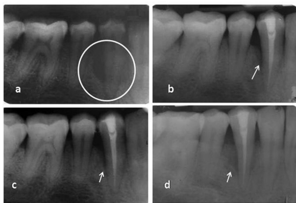
Figure 1. Case 1 IOPA radiograph showing endoperio lesion encircled (a), follow up – 6 months (b), follow up -9 months (c), follow up -1 year (d). Arrow indicates areas of bone fill.