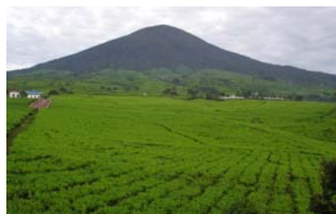
Figure 1. Mount Dempo and the Farm

More importantly, the sites show us that a foreign influence has penetrated the local Besemah culture. As a result, the Besemah people converted into Islam in the