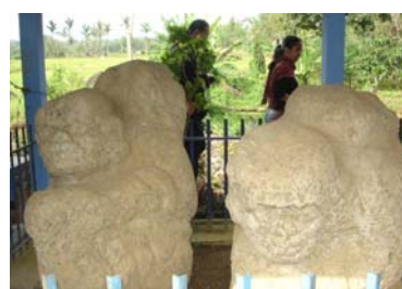
Figure 2. Megalithic's Human Statues