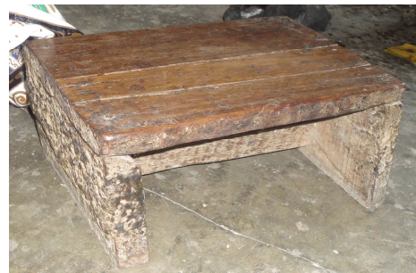
Figure 2. " Dingklik " Stool

Based on Table 1, design of ergonomic chairs for female batik workers was made with the chair dimensions shown in Table 2. The workers need to straighten their legs in order to relax more while they work since their legs are also used to support the patterned cloth. Therefore, data on chair height was reduced by five cm, and afterwards, the dimension/measurement of the ergonomic chair was made.