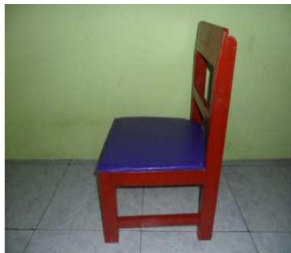
Figure 3. The Designed Chair

The McNemar test results presented significant output on p=0.035 ( p<0.05 ). This demonstrated the difference on workers' musculoskeletal disorders before and after using the designed ergonomic chairs.