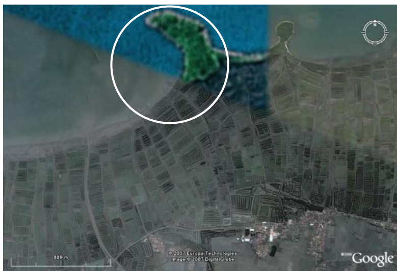
Figure 1. Pulau Dua Nature Reserves, Serang, Banten Province

This research consisted of field research and laboratory research. The field research was conducted in CAPD, Serang (Figure 1).