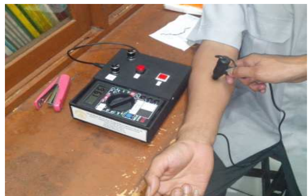
Figure 1. The Way of Using the Photometer

The activity of each group was conducted for 3 months (+/90 days). The evaluation of patients condition can be seen from the change of HbA1C score before and after the research was conducted, as well as the observation on the score of daily FBG.