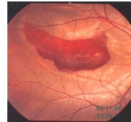
Figure 3. before injection with visual acuity of 1 m CF which remained until 7 days post

A 23 yo female complained of sudden visual loss in the right eye since more than 14 days with a visual acuity of 1m CF (figure 3). One week after injection, no displacement of the hemorrhage was noted, and visual acuity remained 1 m CF (figure 3). No systemic abnormality was found and no complications occurred.