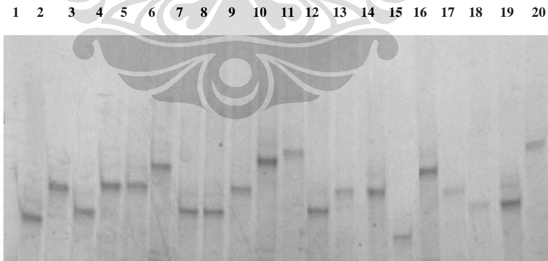
Figure 1. CAG repeat number of the AR gene in oligozoospermic/azoospermic men and normozoospermic men. The CAG repeat fragments of the AR gene were amplified by PCR, electrophoresed in 6% denaturing gel polyacrilamide and stained with silver nitrate. Differences of the CAG repeat number among samples were shown. Slot 1 to 20 were sample with 21, 25, 22, 25, 25, 28, 22, 22, 25, 29, 30, 22, 25, 25, 19, 28, 25, 23, 23, 31 CAG repeats respectively.

Serum FSH and LH level of oligozoospermic/azoospermic men were higher than normozoospermic men ( p = 0,000 and 0,021 respectively, Table 2). In contrast, there was no difference in the level of serum testosterone between the two groups ( p = 0,231 ). According to Spearman's coefficient correlation, there was no correlation between the CAG repeat number and sperm concentration ( r_s = -0,038 ; p = 0,775 ) as well as between the CAG repeat number and hormonal level ( r_s FSH = 0,204 , p = 0,152 ; r LH = 0,245 , p = 0,083 ; r_s testosterone = 0,030 ; p = 0,834 )