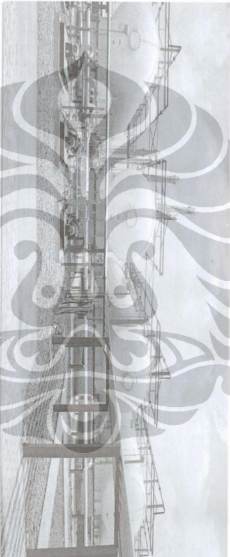
LAMPIRAN 4 GAMBAR KILANG LPG PT. X