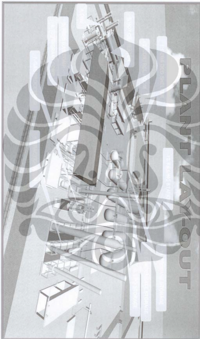
Sumber : Departemen Operasi PT. X