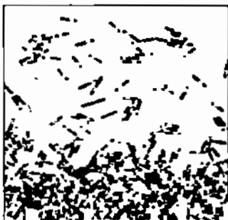
Figure 1. Gram stain of Clostridium difficile showing characteristic Gram positive rods

Clostridium difficile is ubiquitous in nature and has been isolated from soil, water, and stool of many healthy infant but from the stool from only about 3% of healthy adult volunteers. In a minority of the population, C. difficile is a normal intestinal flora, which can be part in as many as 50-80 % of healthy neonatus, and less frequently (3%) in individuals over two years of age. C. difficile is a species of bacteria of the genus Clostridium which are gram-positive, anaerobic, spore-forming rods, motile, and characteristic obligate anaerob. The species was named "difficile" because initially it was difficult to culture. Under the microscope after Gram staining, they appear as long drumsticks with a bulge located at their terminal ends (figure 1). C. difficile has