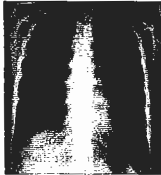
Figure 3. Repeated chest X-ray after treatment showed improvement