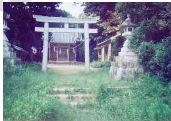
Figure 3. Shinto shrine is in bad condition because no one cares anymore with its existence. This shrine located about 2 km near the Toyohashi University of Technology