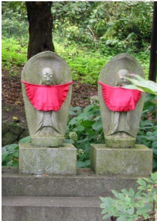
Figure 11. Jizoo , who relieves peoples from suffering and distress

to realize, the Japanese then put the o-mikuji at the branch of the tree near the shrine or temple as depicted in Figure 9.