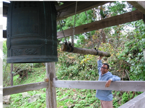
Figure 4. Ringing of the temple bell ( joya-nokane ) one hundred and eight times at the temples all over the country on new years

Many homes hang shime nawa (New Year decoration) outside the home at the entrance or gate to ward of evil. There are a pairs of rice cakes ( kagami-mochi ), the