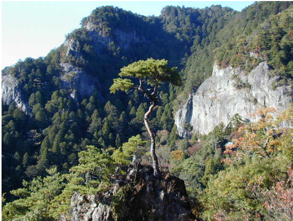
Figure 10. Sacred Mount Horaiji, near Toyohashi