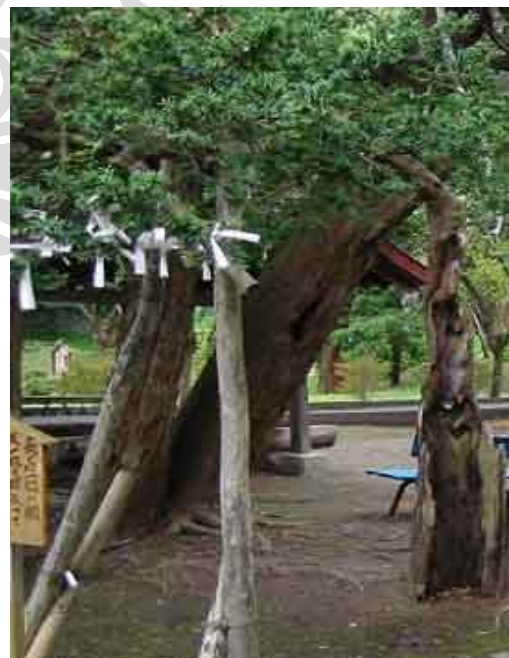
Figure 9. Put the o-mikuji at the branch of the tree to avoid the bad things, and hoping the good thing that written in the o-mikuji will soon realized