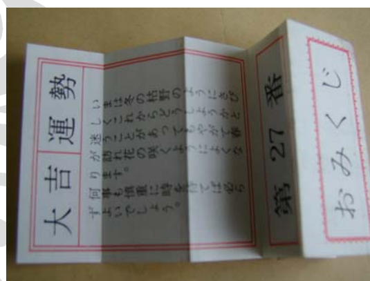
Figure 8. The o-mikuji , a written oracle that tells fortune