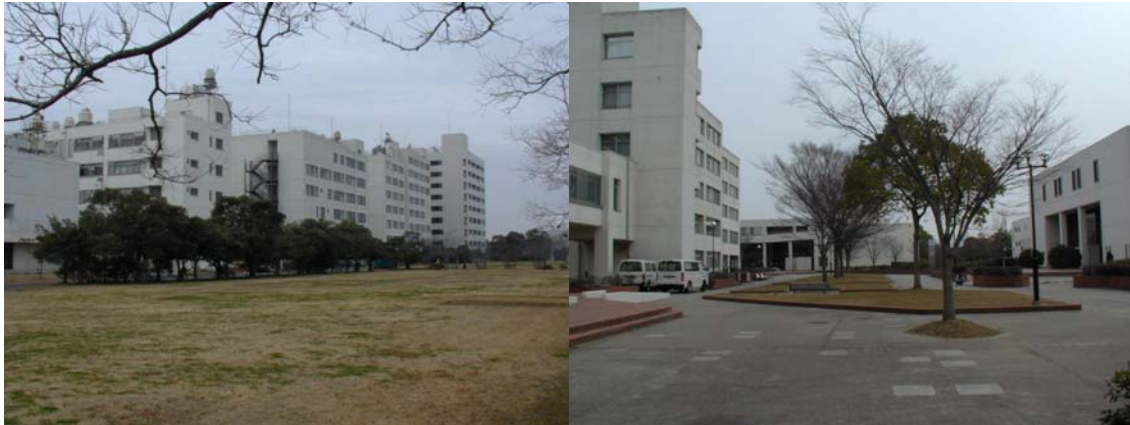
Figure 1. The campus of Toyohashi University of Technology

will work at Japanese company around the world including Indonesia. The understanding from Indonesia side should also be improved so that harmony cooperation could be realized.