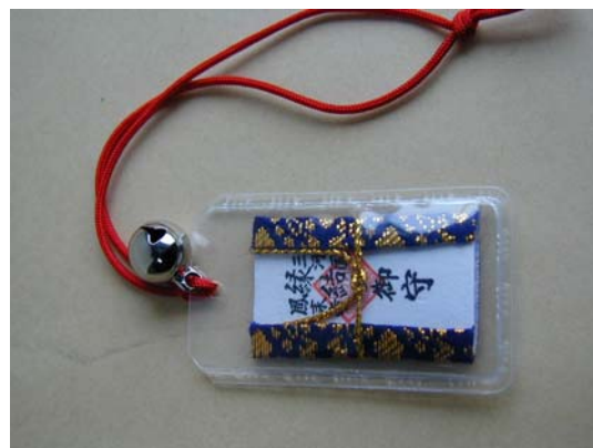
Figure 7. The amulets for happiness in get married

After take the o-mikuchi and read it, in relation to avoid the bad thing come out or in hoping the good things part