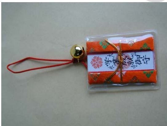
Figure 6. The amulet for success in study