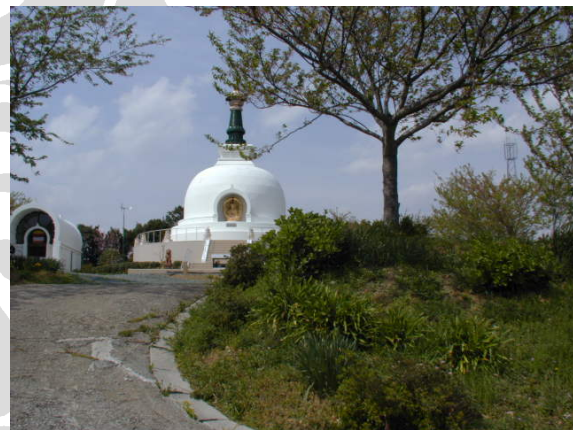
Figure 2. A Buddhist temple is about 1 km near the Toyohashi University of Technology. There is no even one Japanese student from The University that comes to this temple for praying along 2005

Beside there is no even 1 student from Toyohashi University of Technology that visit the Shinto shrine near the University, also 1 from that 4 shrine are in bad